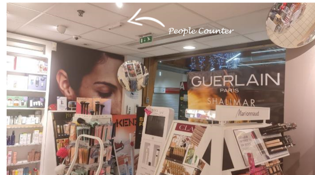
3D Pro2 people counter installed in one of the retail stores.